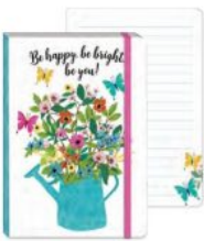
47058 Full Bloom Watering Can glossy highlights