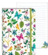
47056 Full Bloom glossy highlights

Available in different designs. Each design is sold separately in different listings.