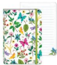
47056 Full Bloom glossy highlights