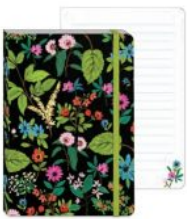
47057 Full Bloom Black glossy highlights