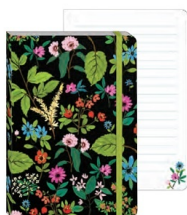
47057 Full Bloom Black glossy highlights