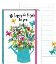
47058 Full Bloom Watering Can glossy highlights