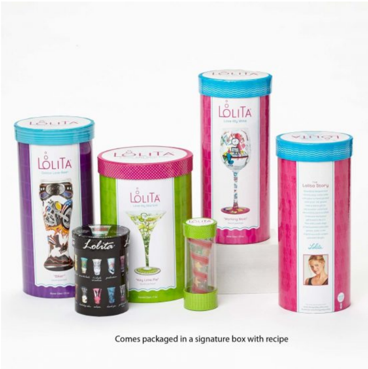
Comes packaged in a signature box with recipe