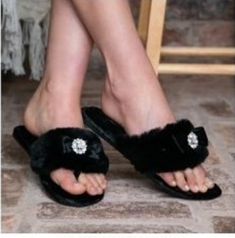
Toe Post Slippers